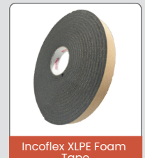
Incoflex XLPE Foam Tape