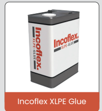
Incoflex XLPE Glue

Incoflex XLPE IncoClad is a high-performance pre-clad insulation with built-in weather, UV, moisture, and vapor resistance—eliminating the need for additional jacketing or coatings.