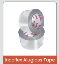
Incoflex Aluglass Tape