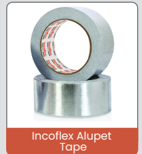
Incoflex Alupet Tape